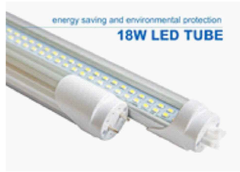
TYPICAL 18W LED TUBE