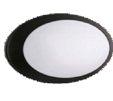
TYPICAL LED BULKHEAD